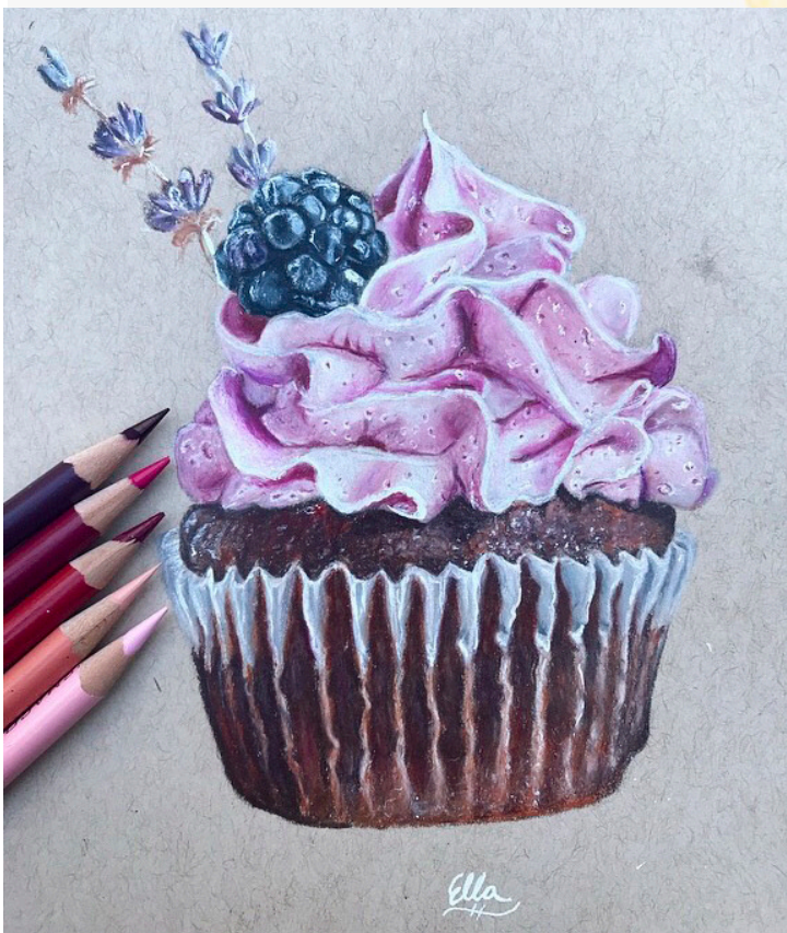
Drawing by Ella Sobel from Walnut Creek

Although we can't be together after the holiday season we remain connected through all the work that our teachers, staff, students, and parents have put forth thus far to make Tilden what it is even during trying times. We all look forward to our return to campus!