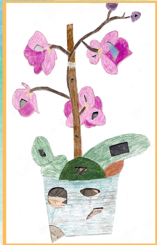
PAIGE BROCKMEYER - GRADE 10