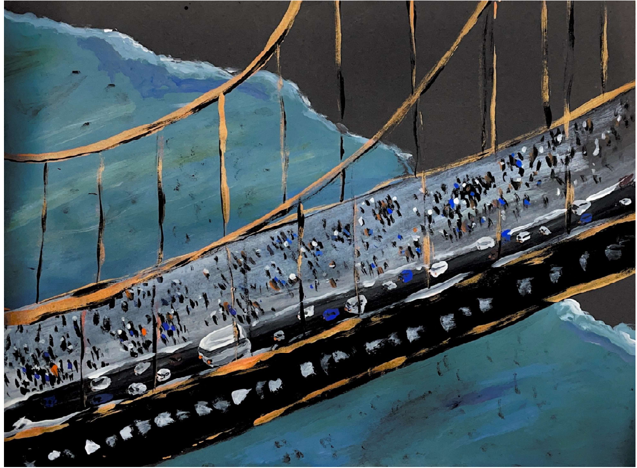
ELLA SOBEL - GRADE 9