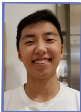
Grant Park CLASS OF 2019 WALNUT CREEK