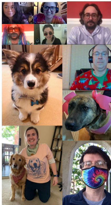
Albany Spirit Week Collage